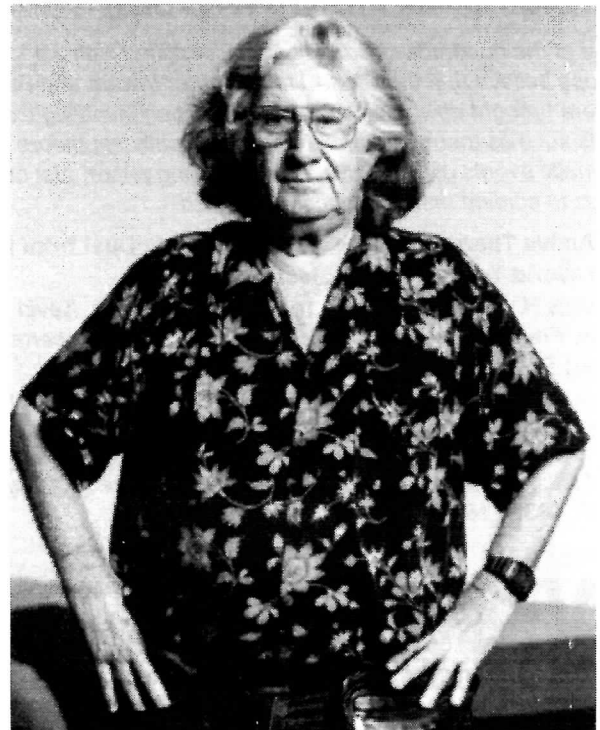
Augusto Boal, dramatist, was born on March 16, 1931. He died of leukaemia on May 2, 2009, aged 78

In addition to Boal's Theatre of the Oppressed , published in English in 1979, his influential Games for Actors and Non-Actors (1992) and The Rainbow of Desire: the Boal Method of Theatre and Therapy (1995) are also available in translation, along with his memoirs Hamlet and the Baker's Son: My Life in Theatre and Politics (2001).