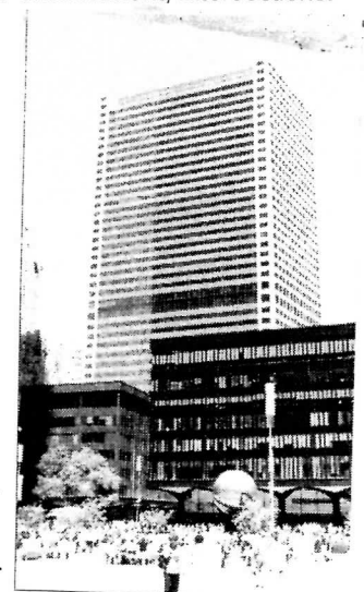
World Trade Center Bldg 7 See 9/11 articles Page 1 ff.

Sat-Sun, 28-29 Mar, UMass, Dorchester. One State for Palestine/Israel: a country for all its citizens? Sponsor: Trans Arab Research Institute (TARI), and William Joiner Center for the Study of War and Its Social Consequences (UMassBos). Leading scholars from Palestine, Israel, Canada, US, Europe. Free. onestateforpalestineisrael.com