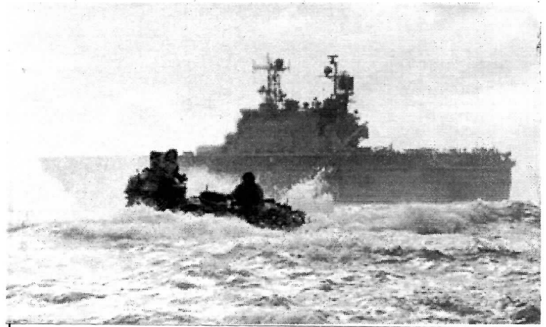
Prison Ship USS Peleliu

First of all the Republican party is in a very good position to steal this election. Whether it's Clinton or Obama who is the Democratic nominee makes very little difference. The Republicans very much wanted Hillary Clinton to be the nominee. That's why they've been manipulating the results of the primary throughout this season ever since New Hampshire. They, I think, have worked out a very thorough play-book for representing a Clinton-McCain contest as an epic clash between Rambo and Hanoi Jane, and I think (Continued on Page 6 >>)