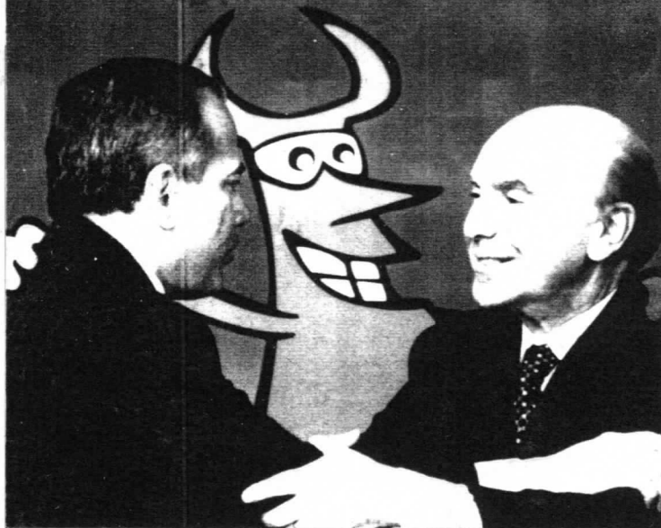
Pro-Chávez campaign poster: "The Devil Unites Them"