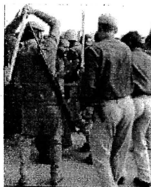
Police Attack Protesters at Mehdiganj