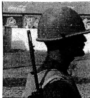
Armed Protection for Coca-Cola Plant in Mehdiganj

"With the pesticides in Coca-Cola products, at least consumers have a choice—they can choose not to drink Coca-Cola. The villagers of Mehdiganj and surrounding villages do not have such a choice. Their water tables are dropping