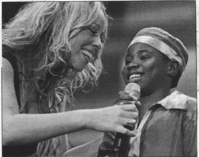
Mariah Carey performs at LIVE 8 London, July 2nd.

There are two main methods for making hydrogen. The dominant commercial method uses natural gas and steam to produce ultimately hydrogen and carbon dioxide. In this process, called steam reforming, less than 80 percent (Continued on page 5 >)