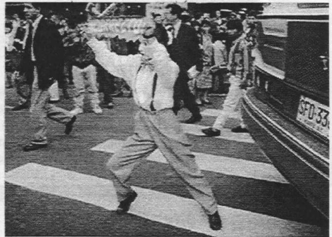
Bogotá traffic mime flashes "INCORRECTO"

Luis Eduardo Garzón, the new mayor of Bogotá, is the first leftist who has been in charge of the second-most important political position in Colombia. Said Mockus, "His election expresses a consensus around the importance of addressing social issues. Garzón has the challenge of opening space to new political forces in a country that has been dominated by a ' bipartidismo bobo ' (dumb two-party system)."