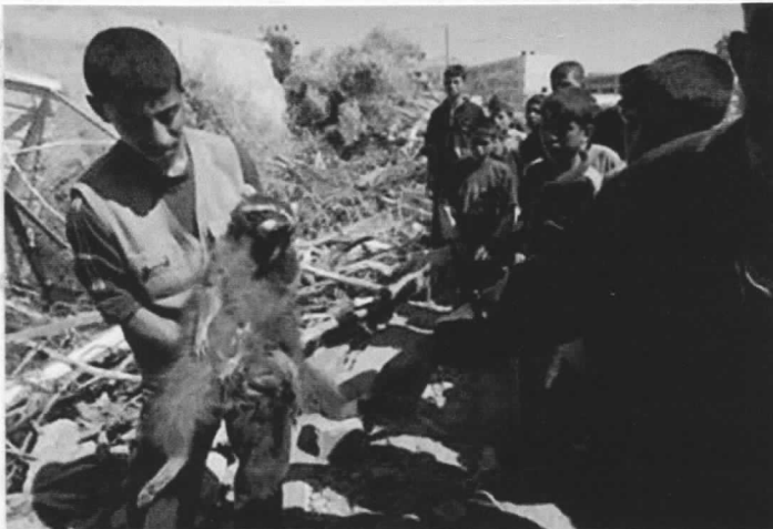
A Palestinian youth holds a badly injured racoon after pulling it from the rubble of the destroyed zoo in the Brazil section of the Rafah refugee camp, southern Gaza Strip, Friday, May 21, 2004. Many of the animals at the small zoo either escaped or died in the destruction, the owner said. Israeli troops pulled back from two neighborhoods in this sprawling Palestinian refugee camp Friday, leaving behind dozens of demolished and damaged homes, torn up roads and flattened cars.