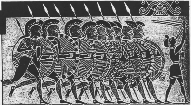
Greek phalanx used in invading Italy and crushing the Romans. After two such victories, losses proved too great and the Greeks had to leave.

T HIS IS PERHAPS the most hotly debated question these days in union halls and on picket lines. Countless defeats, and an all-time low in the number of strikes, seems to indicate no. And indeed that is the consensus, at least among business leaders, politicians, (Continued on page 4 >>)