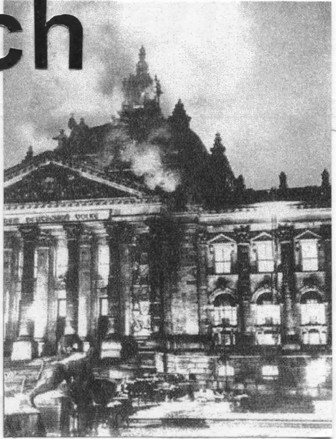
Reichstag burning, Berlin, 1933 (see page 2)