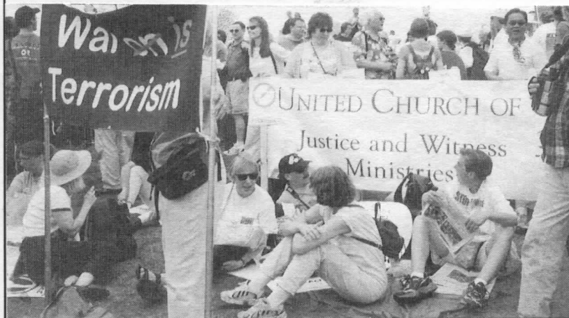
Marchers gather at Washington Monument (see page 6)