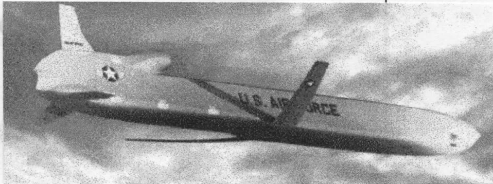
AGM-86C Conventional Air Launched Cruise Missile

By 12:30 the fire had been got under control. At the Prussian Ministry of the Interior, a special meeting was called late tonight by Captain Goering to discuss measures to be taken as a consequence of the fire.